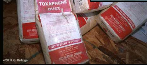
4/00 R. G. Bellinger